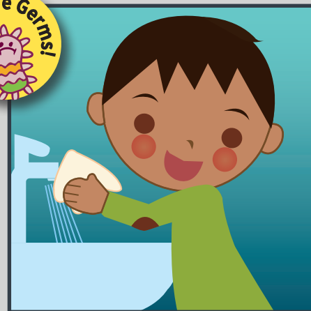
6 TURN OFF TAP with paper towel

Adapted with the permission of The Regional Municipality of York.